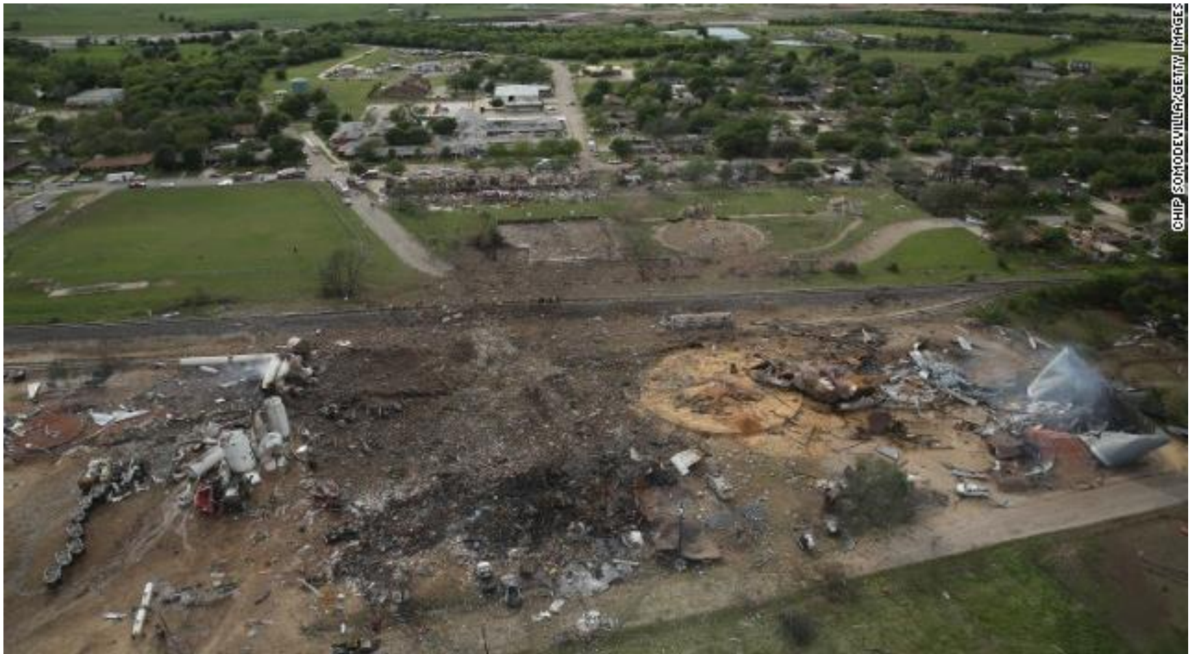
West, Texas – Fertilizer explosion, 15 dead