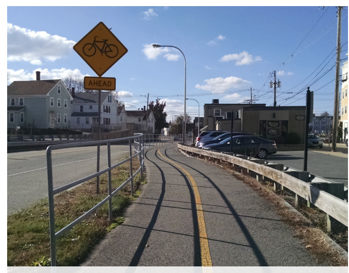
Assabet River Rail Trail, Hudson

Sidepaths are shared use paths that run adjacent to roadways. The Assabet River Rail Trail (right), a sidepath along Main Street in downtown Hudson, follows the original alignment of the Massachusetts Central Rail Line. Sidepaths can also be built along highways and across bridges. They supplement the established roadway and transportation network to provide a safe, separated facility. They can provide direct access to businesses, schools, and other destinations, but safety at intersections and driveways must be carefully considered during planning and design.