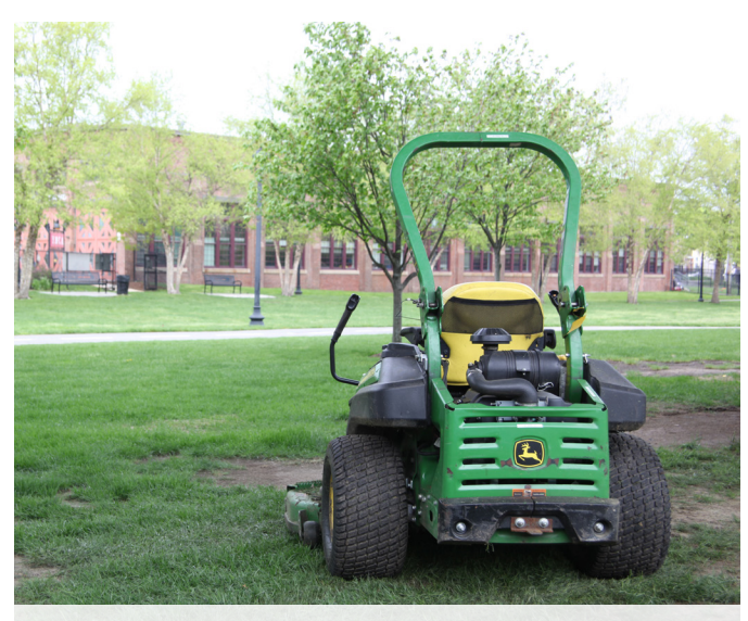
Maintenance includes operations, landscaping, and amenities.

With regular maintenance, the hard work and resources that go into building a shared use path will endure, improving quality of life not just for today's users but for future generations.