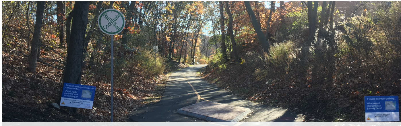
Cochituate Rail Trail, Framingham

tend to be wide and flat. Because of their alignments and abandoned status, former rail corridors sometimes lack convenient access to businesses, schools, and other destinations. In such cases, on-street sidewalk or bike lane connections to and from the rail trail allow users to access their desired destinations.