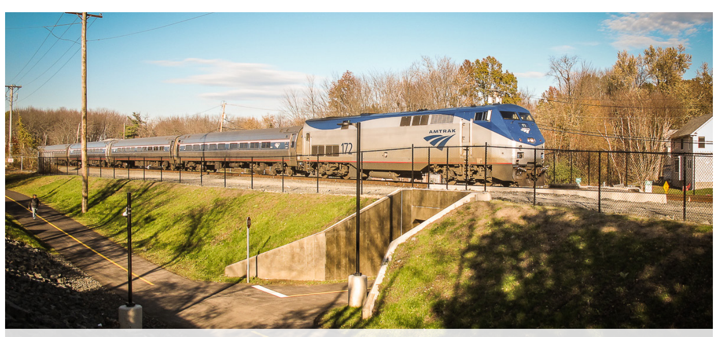
Northampton Bike Path, Northampton.

longer connections between communities. Similarly to rail trails, rails with trails may not provide direct access to businesses and other destinations. Safety measures are very important to the success of this path type. Sufficent corridor width is required to allow safe separation between the rails and the trail. This can be accomplished with adequate buffer space, barriers such as fencing or hedges, and by providing safe crossings.