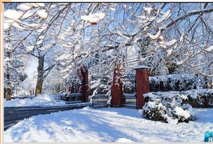
Phillips Academy, Andover 2015 Essex Heritage Photo Contest