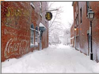
Threadneedle Alley - Newburyport